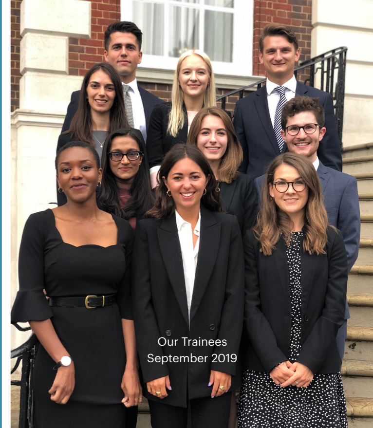
Our Trainees September 2019

So far I have sat in Disputes, Employment and Corporate and I am moving to Charities next. Each seat has been totally different and I feel like I am building a diverse skill set and a broad network across the firm. The six seat system operates so that trainees return to the department they will qualify into for their sixth seat. This makes the transition from trainee to qualified solicitor much smoother and means you really feel part of your chosen team by the time you qualify."